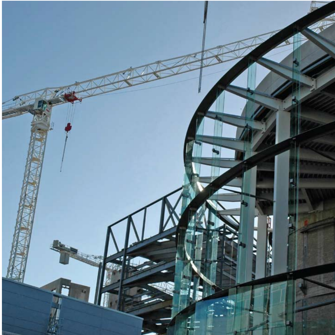
Rothmans, helping to build the future of your business