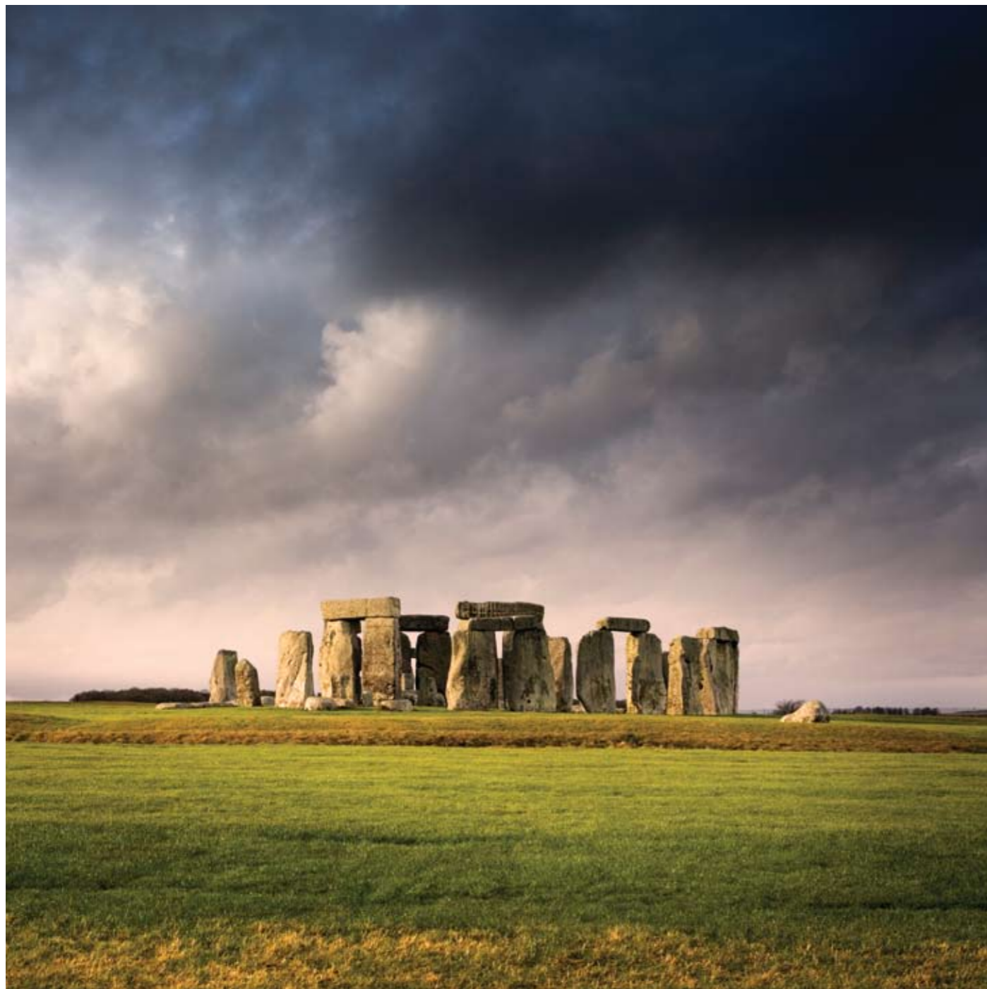
Stonehenge, near Salisbury