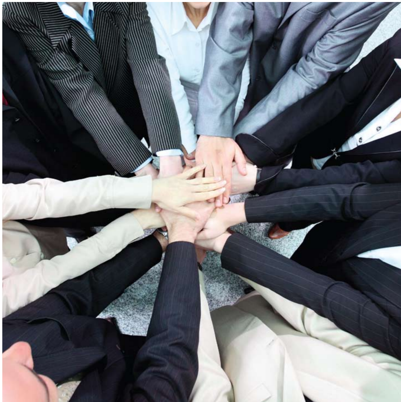
Rothmans, we're part of your team