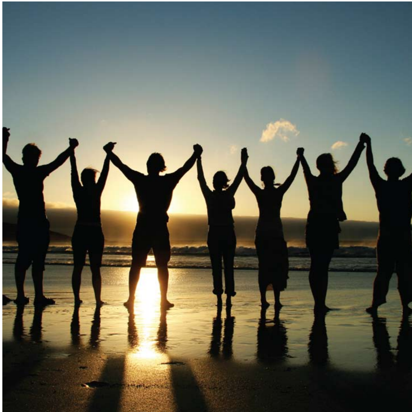
Rothmans, we're part of your team