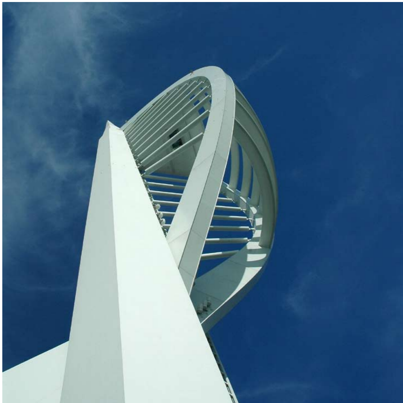
Portsmouth Spinnaker Tower