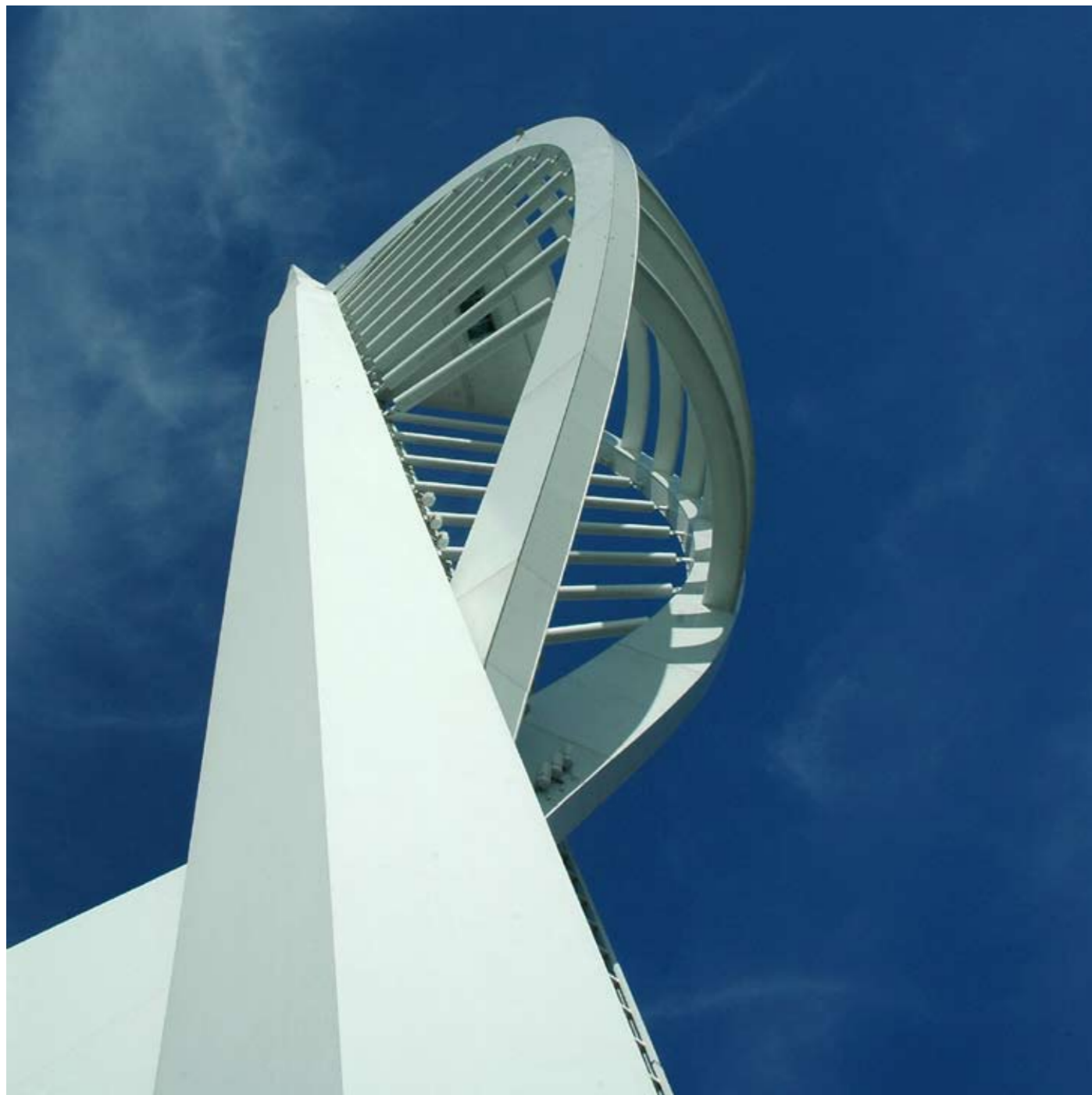
Portsmouth Spinnaker Tower