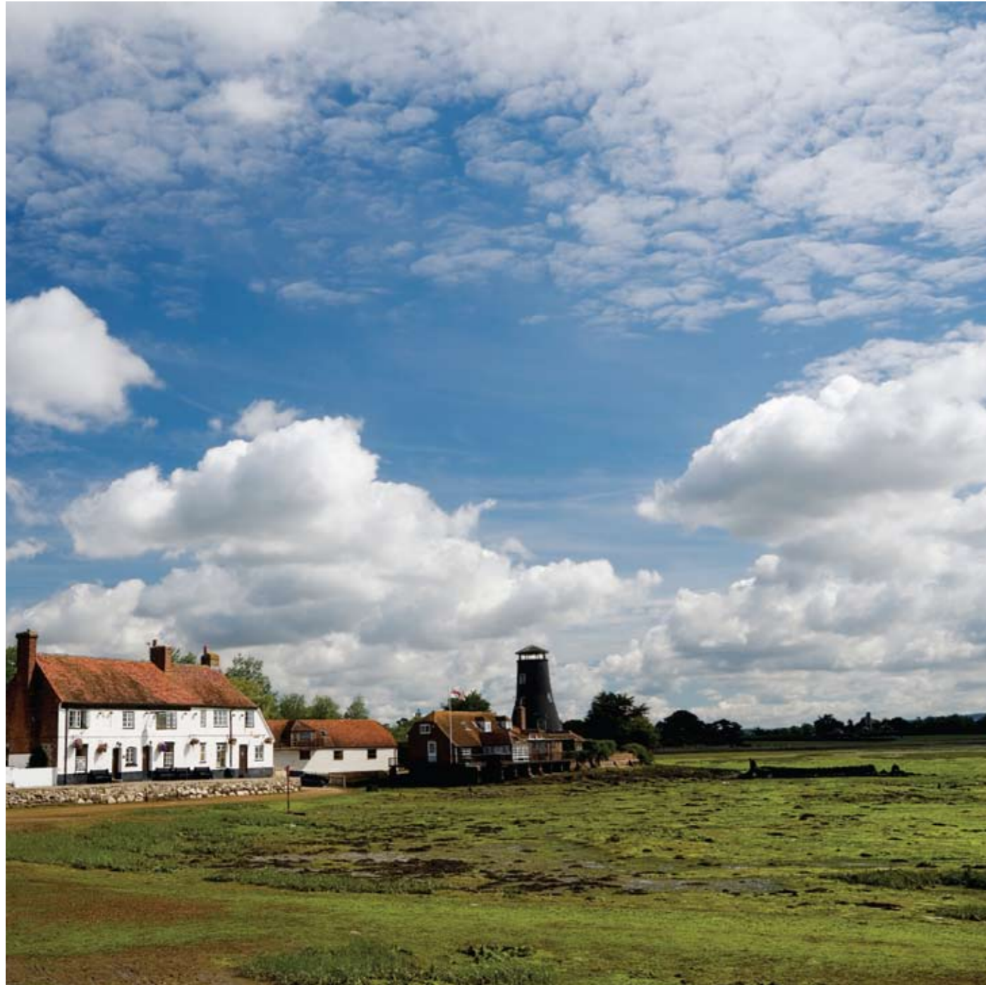
Havant, Langstone harbour