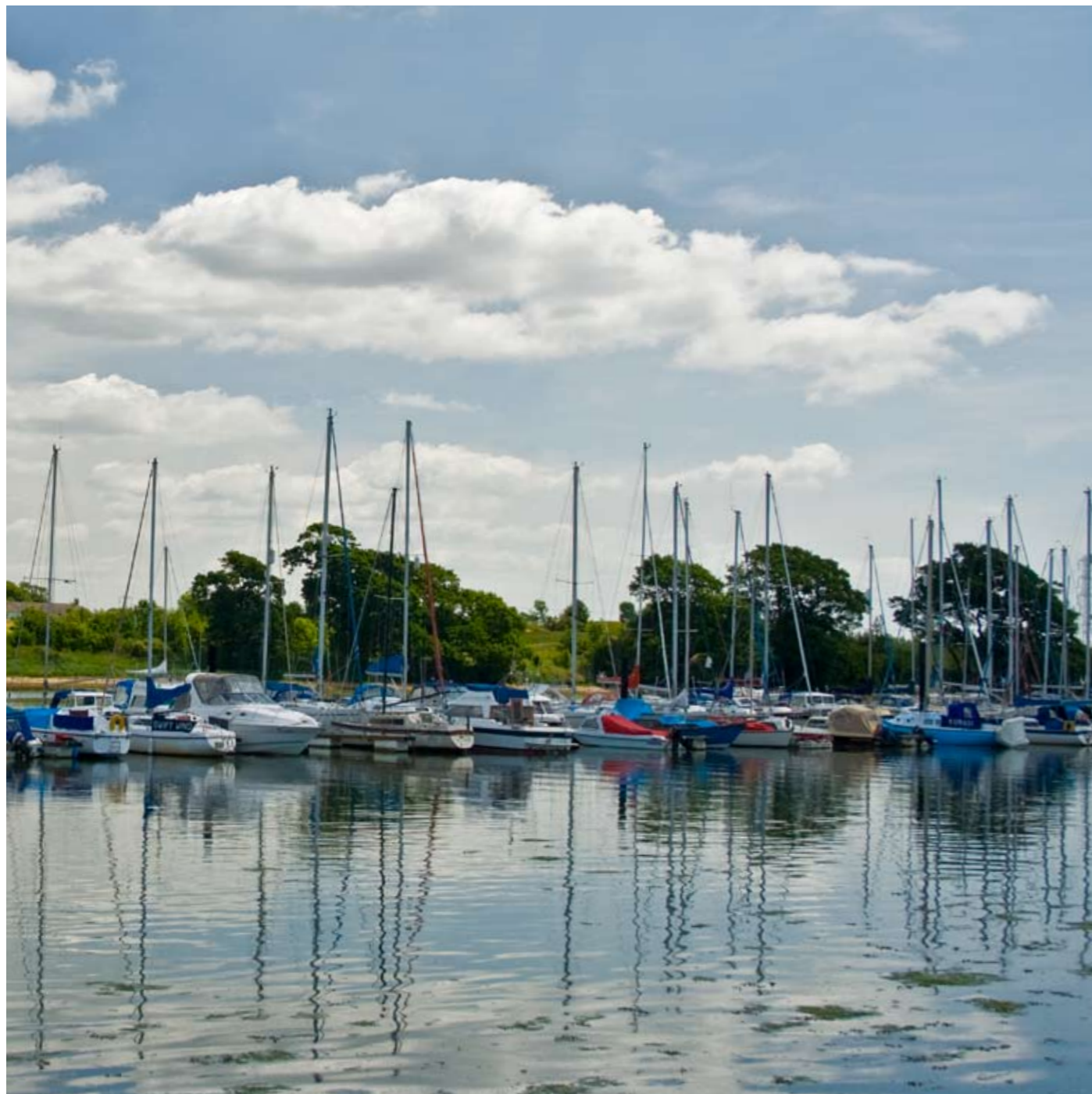
Rothmans Fareham, working as part of your team