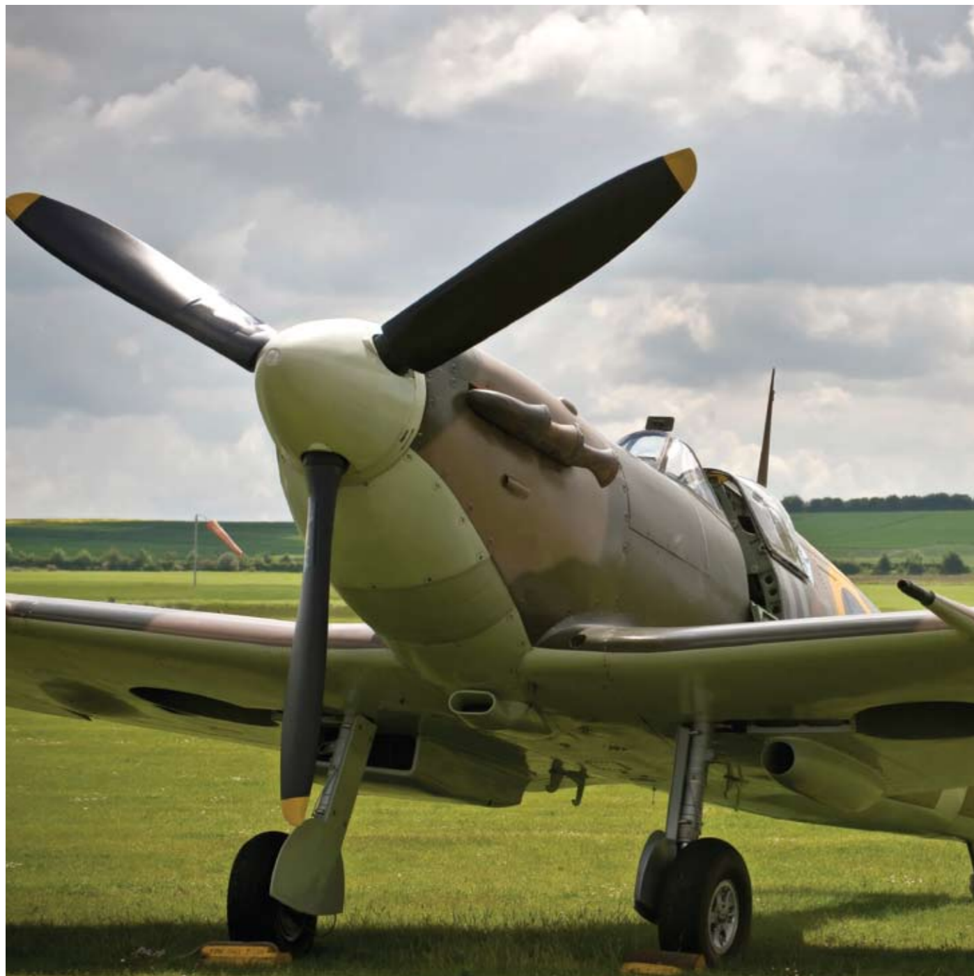
Eastleigh, home of the Spitfire