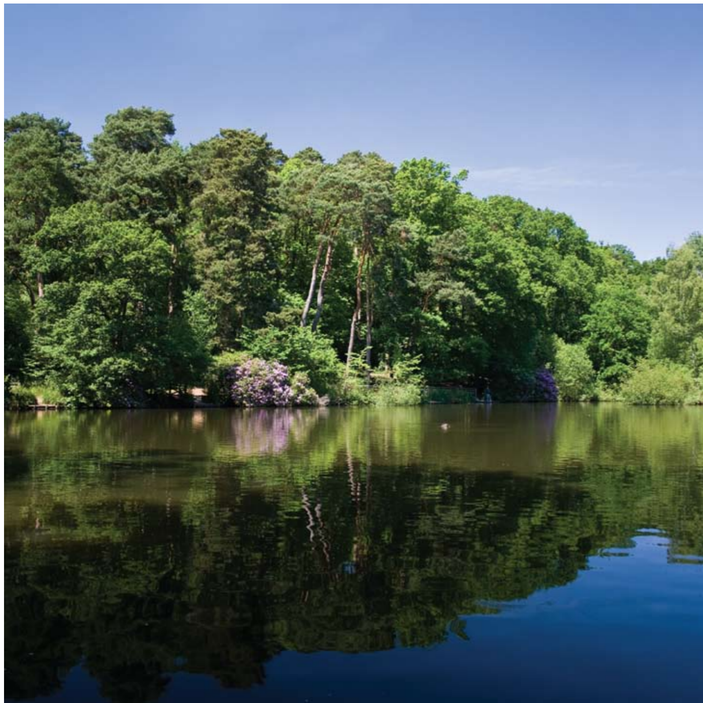
Chandlers Ford, Hiltingbury lakes